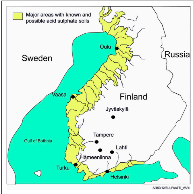
Figure 1. Major areas with known and possible acid sulphate soils in Finland and the location of the cities related to the paper (Wepling et al., 1999).

newspaper articles and official documents. Additional reflections on other cases were also made.